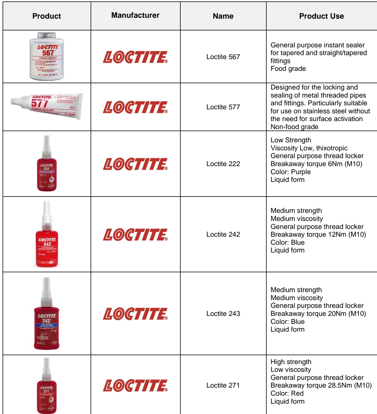
Table 3 - Adhesive List